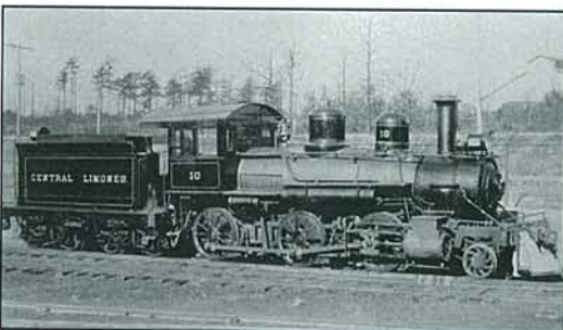
SI&E #1225 was one of many engines exported to Cuba around the WWI years.