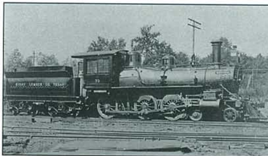
SI&E #1401 in the dealer's yard in Atlanta in 1919.